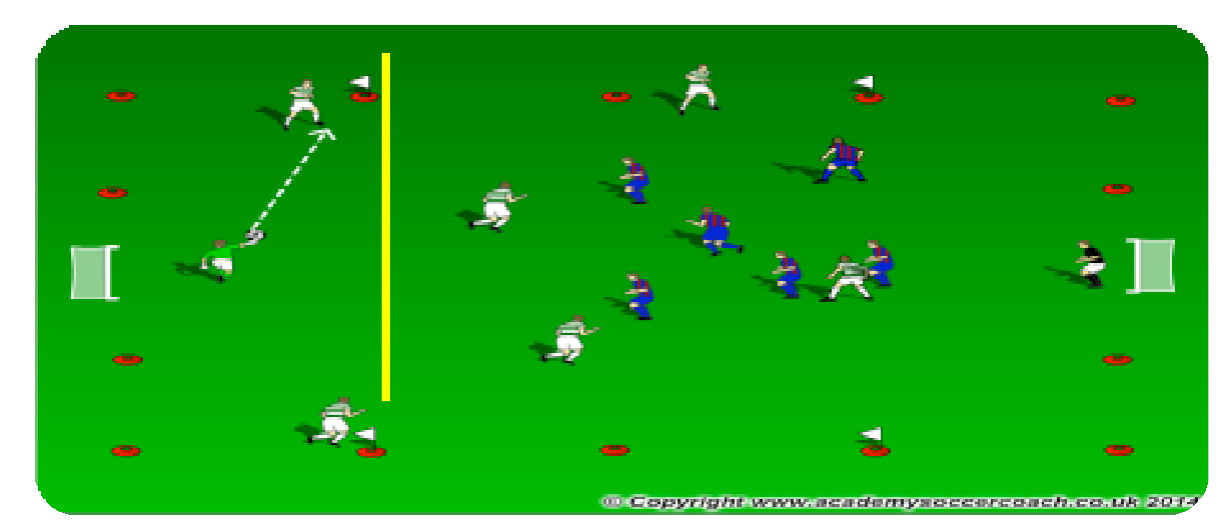
Retreat Line Sample 1